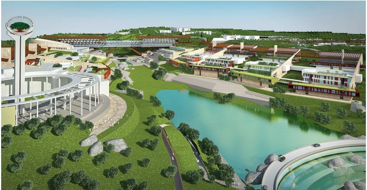
Back inner page Photo