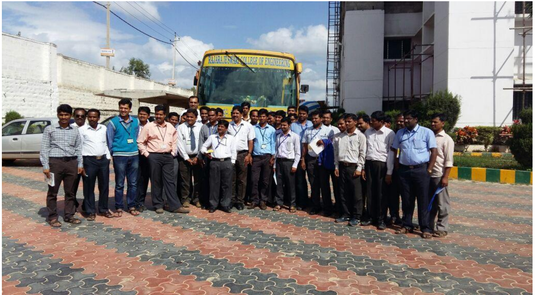
HAL –Helicopter Division Industrial Visit on 24 th June 2015