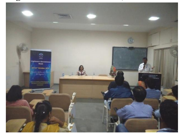
Vigilance Awareness week (26-31 Oct 2015)