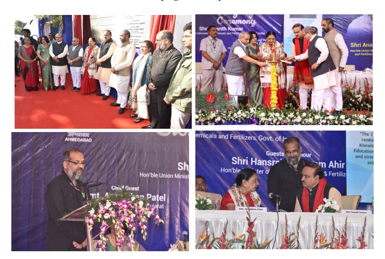
26th January 2016 – Republic Day at our NIPER Gandhinagar Site