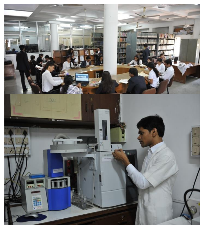
Faculty and Students