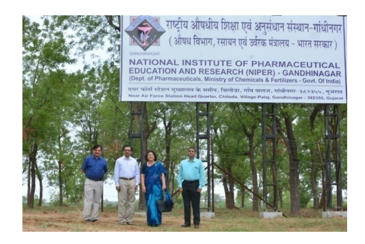
Hindi Pakhwada/Swatch Bharat/ National Integration Day