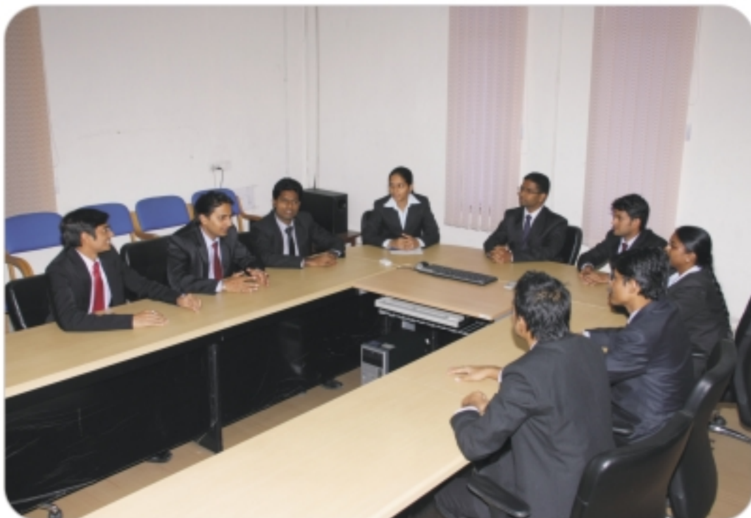
Conference hall and auditorium : The campus has two State-of-the-art conference halls and auditorium. Both are well-equipped with audio-visual Equipments needed for conducting seminars, workshops, etc..