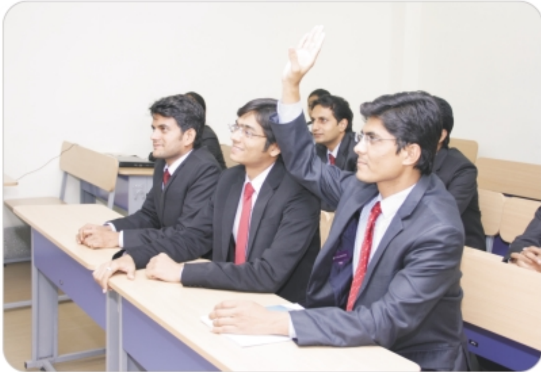
Classroom : Keeping in view the requirements of management education, the classroom is well-equipped with LCD, OHP, and microphones to facilitate teaching.