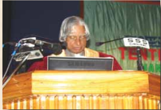
X th Convocation His Excellency, The President of India & Visitor Manipur University Dr A P J Abdul Kalam