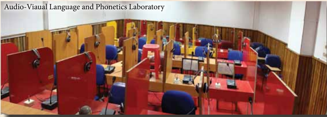
Audio-Visual Language and Phonetics Laboratory

The Audio-Visual Language and Phonetics Laboratory was established in 1984 with financial assistance from the UGC. The Language Laboratory is one of the components of the Laboratory complex. At present, there are 15 booths with feedback facility. The laboratory is used for M.A. courses in Language, Spoken Language Course and Certificate Courses in foreign Languages. The recording studio of the laboratory is used for recording lectures delivered by distinguished visiting scholars. There is also a library of records, films and recorded tapes.