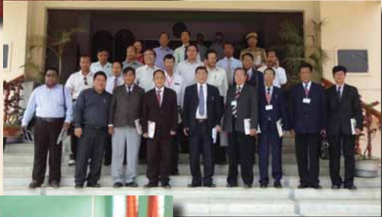
Visit of Myanmar Delegates