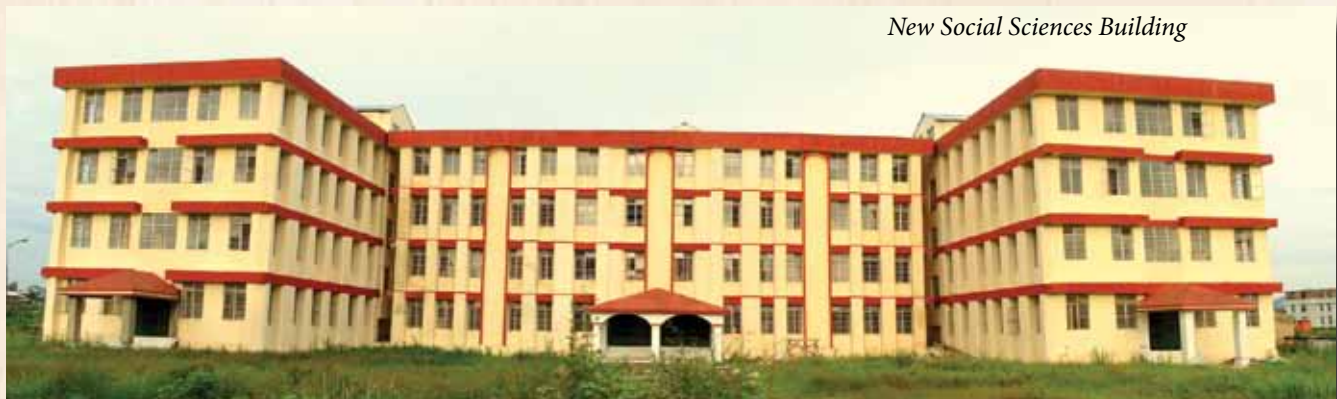
New Social Sciences Building