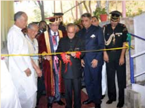
Inauguration of Innovator Exhibition on 29th April 2014 by His Excellency, The President of India Shri Pranab Mukherjee