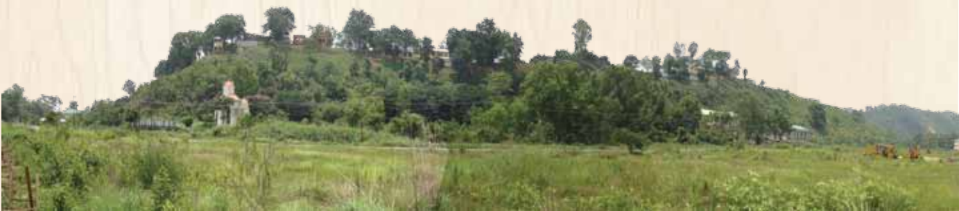
A Scenic View of Langthabal Hill in the Campus