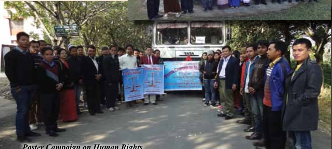
Poster Campaign on Human Rights