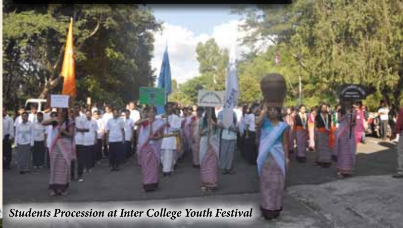
Students Procession at Inter College Youth Festival