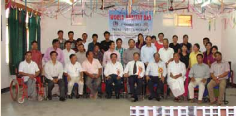
World habitat day