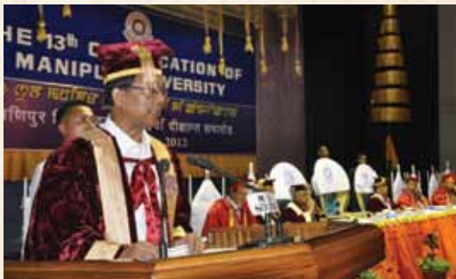
The XIII th Convocation Hon'ble Minister of DoNER Shri Paban Singh Ghatowar