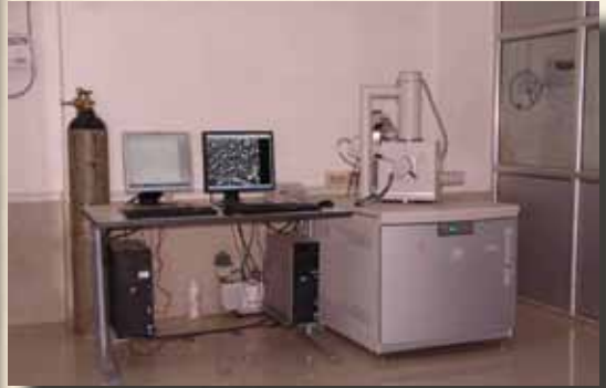
Scanning Electron Microscope