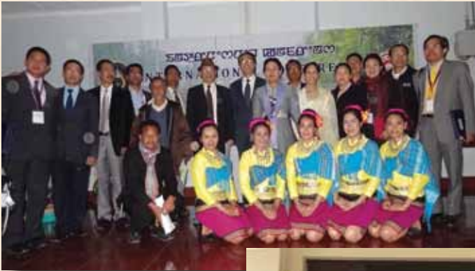
International Conference on “Thailand and North East India: Issues on Sustainable Development”