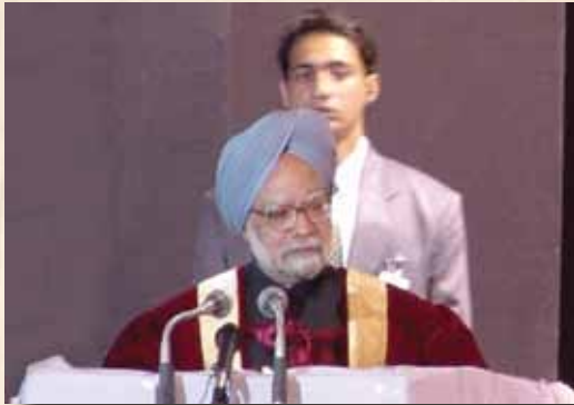
IX th Convocation Hon'ble Prime Minister of India Dr Manmohan Singh