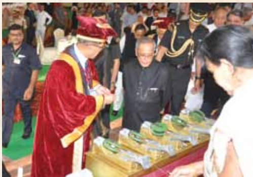
Solar Multi Muga Reeler