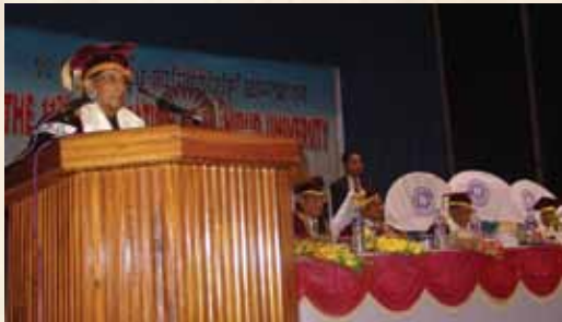
XI th Convocation Hon'ble Minister of DoNER B K Handique