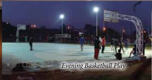
Evening Basketball Play