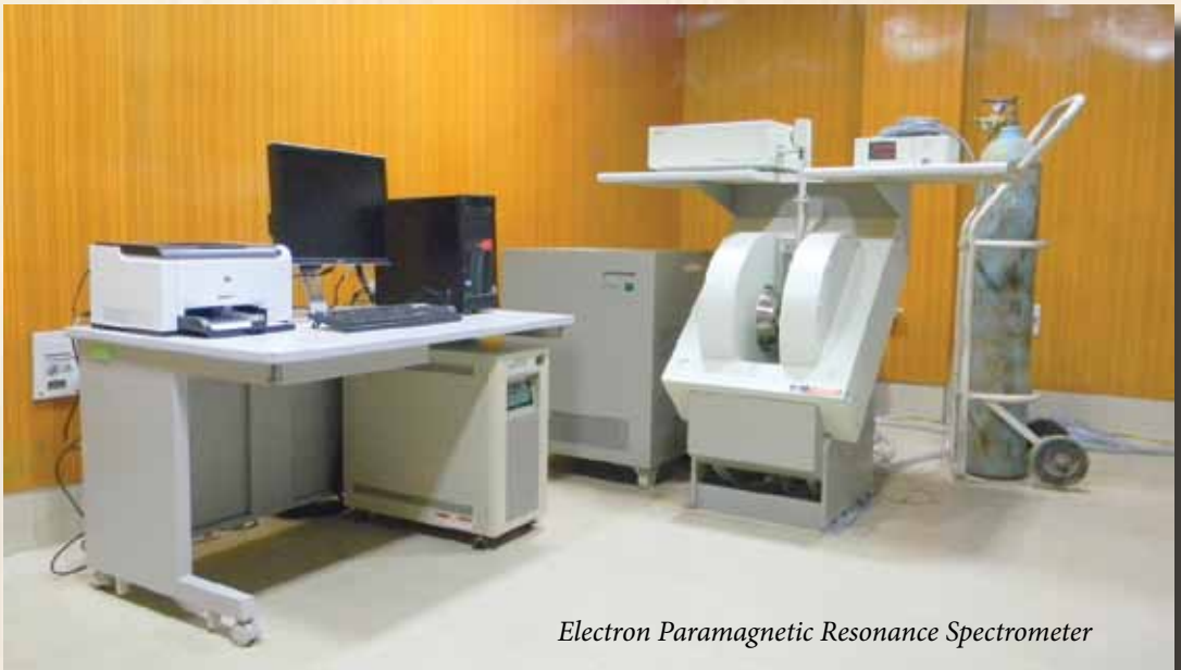
Electron Paramagnetic Resonance Spectrometer