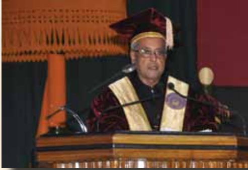
His Excellency, The President of India & Visitor, Manipur University Shri Pranab Mukherjee