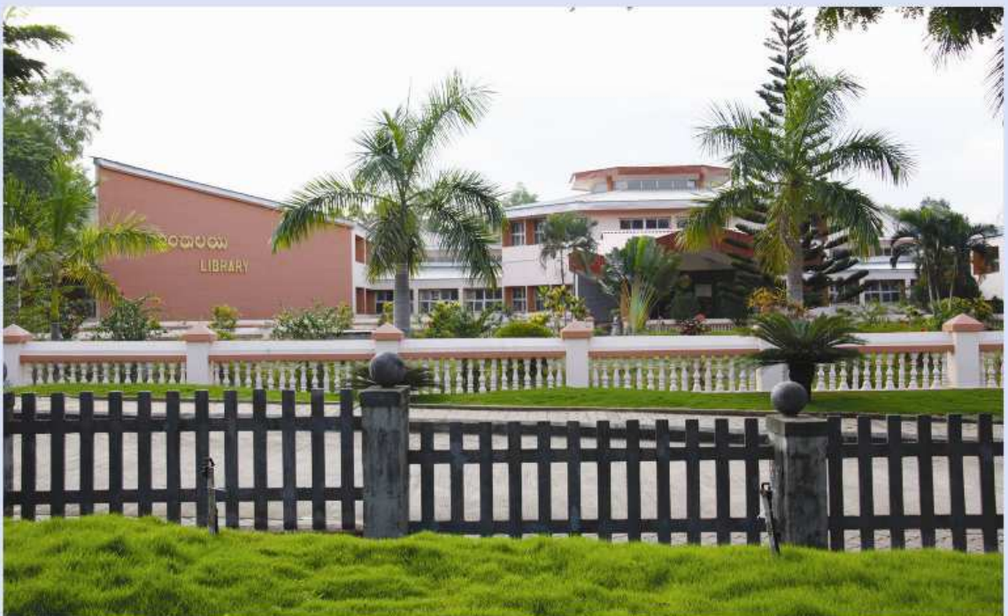
University Library, Mangalagangothri