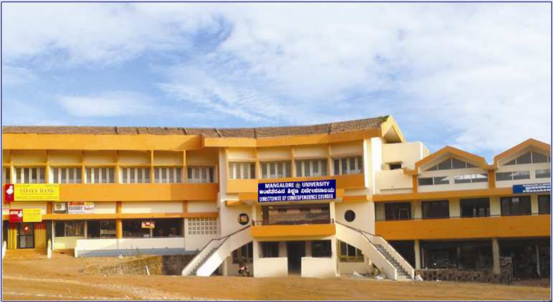
Directorate of Correspondence Courses, Mangalagangothri