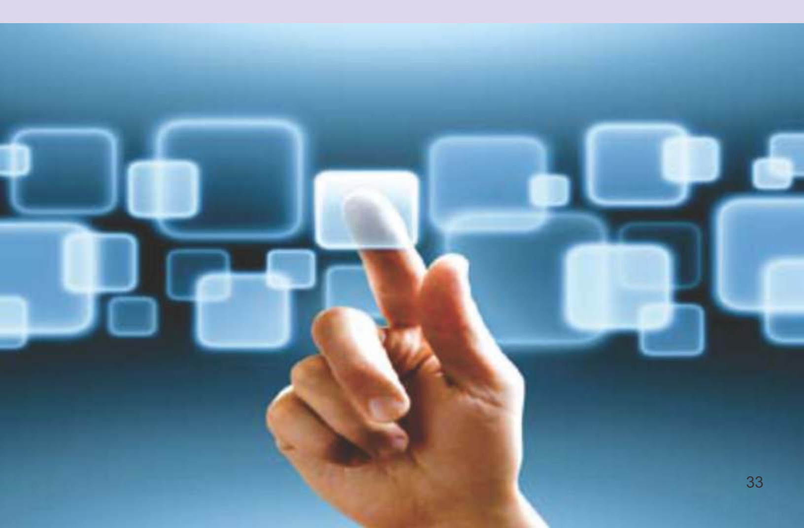
Total Credits of the Programme - 100