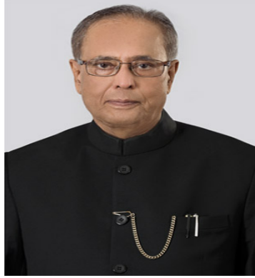
Hon'ble President of India Shri Pranab Mukherjee