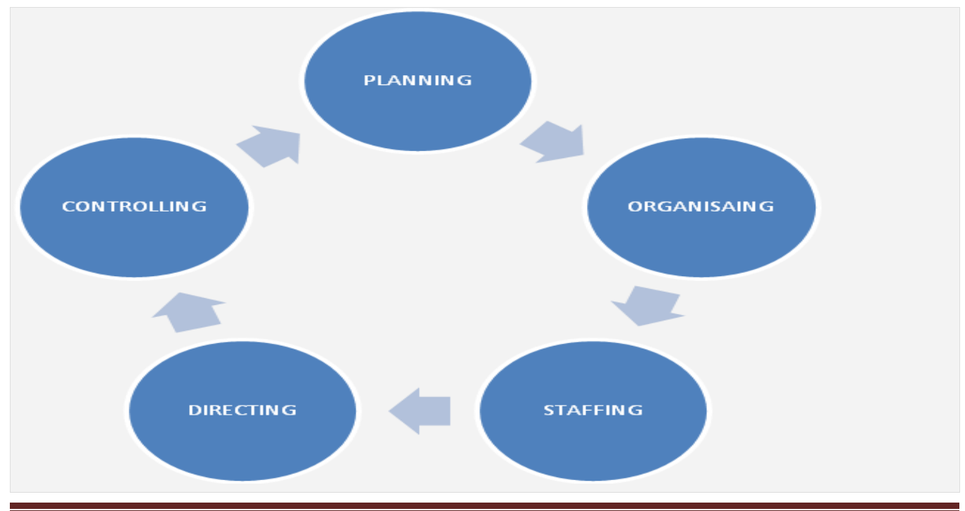
Management Concepts & Business Ethics

Briefly, there are 5 core functions that constitute Scope of Management functions or the process of management. They are Planning, Organizing, Staffing, Directing and Controlling.