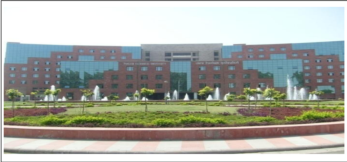
Administrative Block of Punjab Technical University