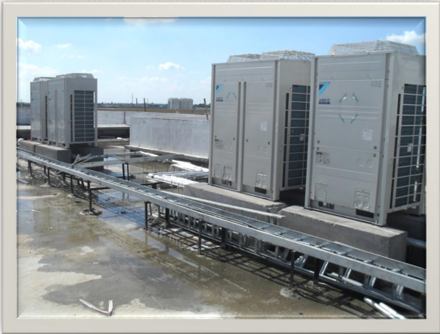
HVAC OUT DOOR UNIT AT ROOF