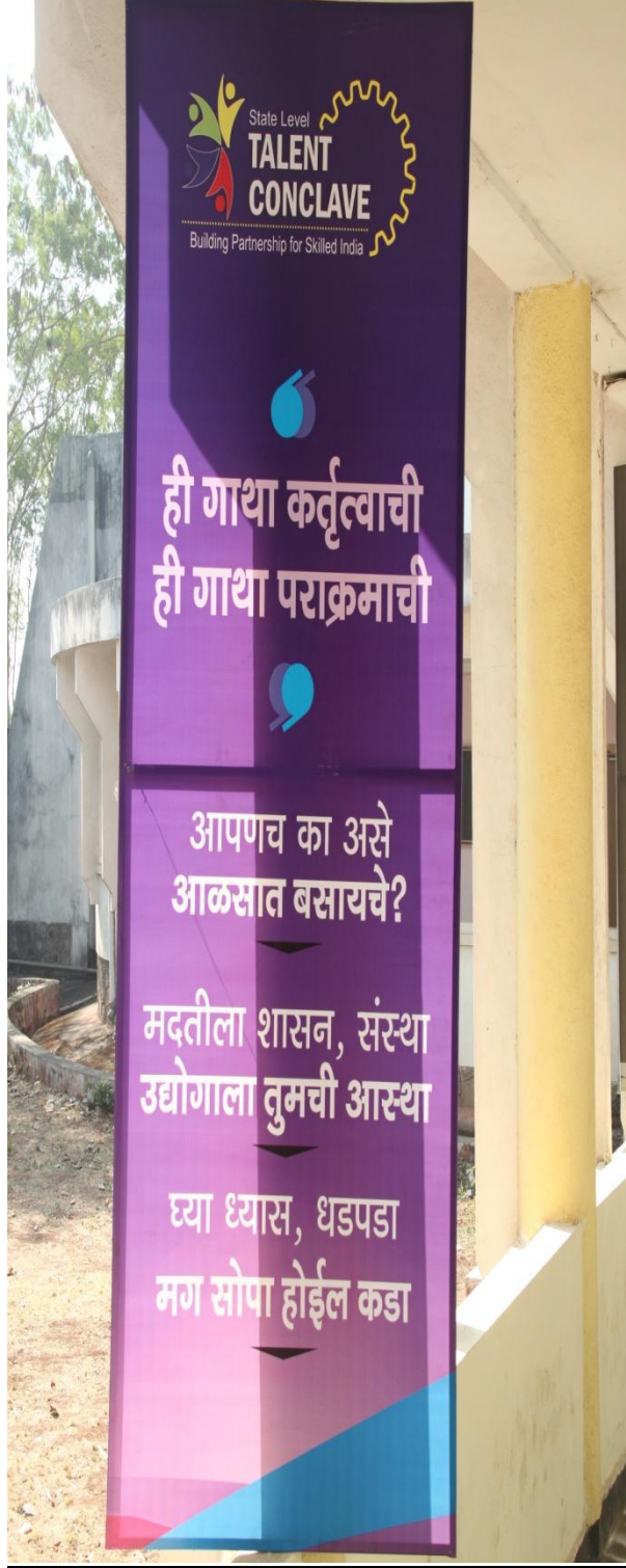
Standees displayed at the venue