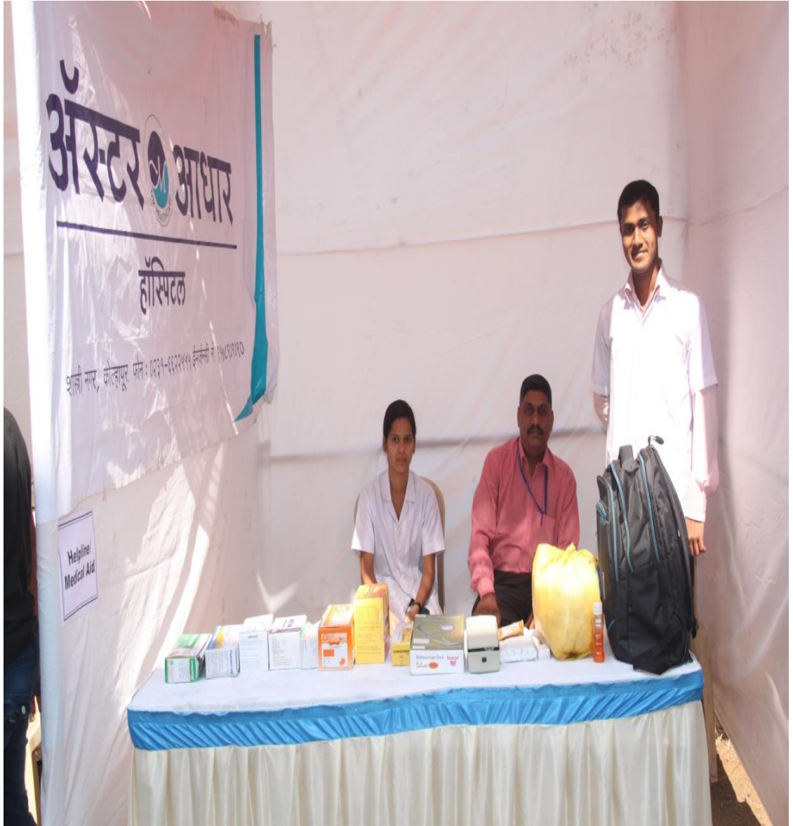
The Medial Stall of Aster Adhar Hospital

Medical Cover Medical cover was provided for the State Level Talent Conclave by Aster Adhar Hospital, Kolhapur