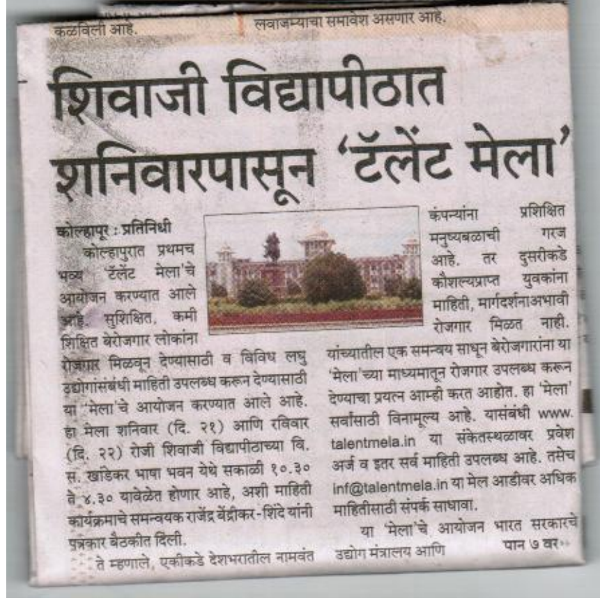
News of press conference published in Newspapers