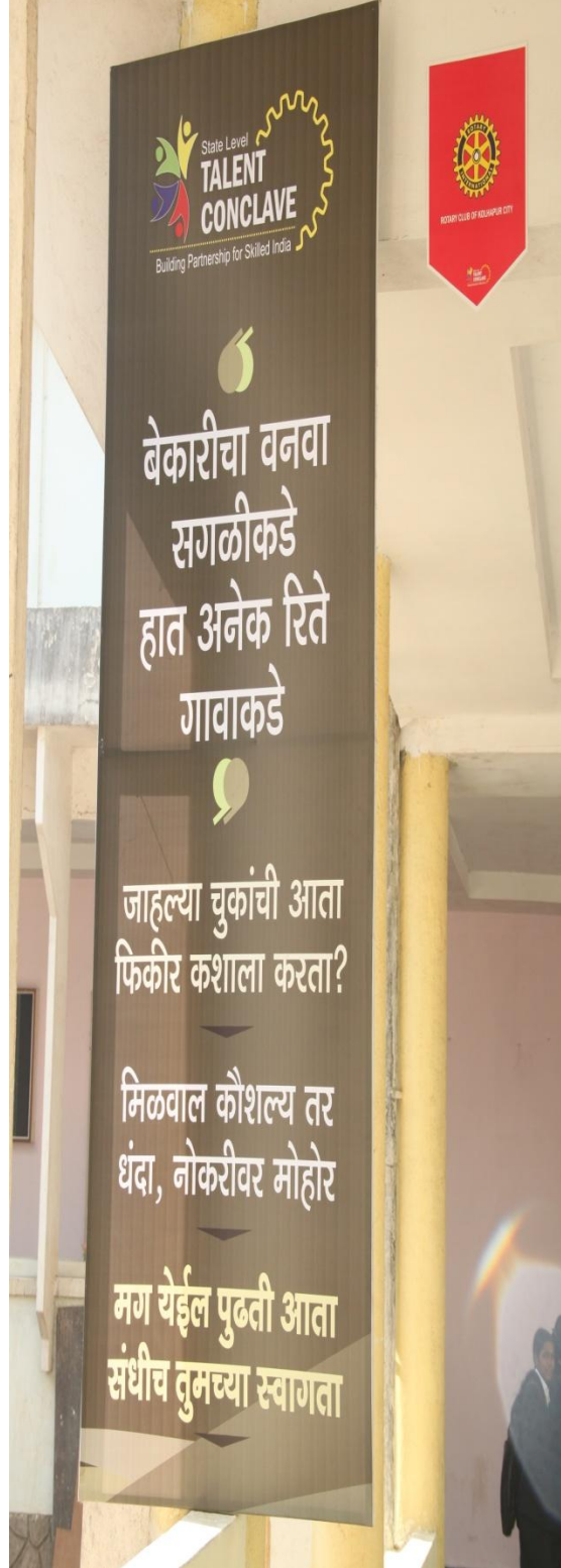
Standeers displayed at the venue