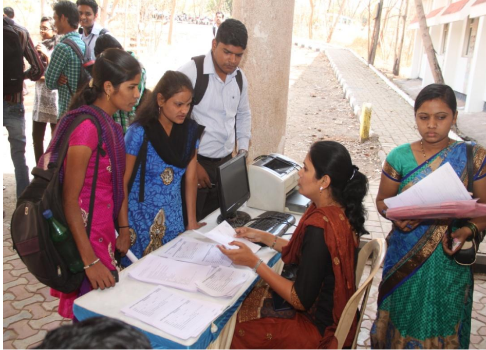
Spot Registration is in progress

National Anthem The function started with singing of National Anthem.