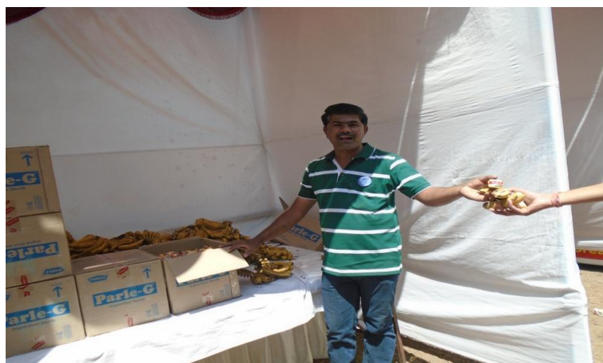
Free Refreshment Stall at the State Level Talent Conclave

A food stall was established at the State Level Talent Conclave and bananas and biscuits were distributed to the students and participants free of cost.