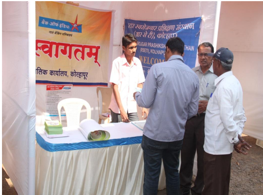
Bank of India Stall