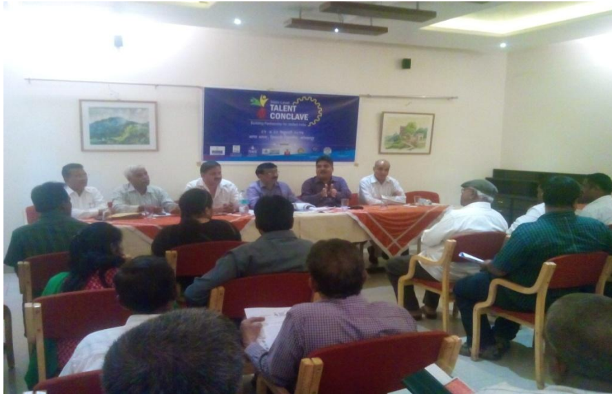
Press Conference held on 31-01-2015