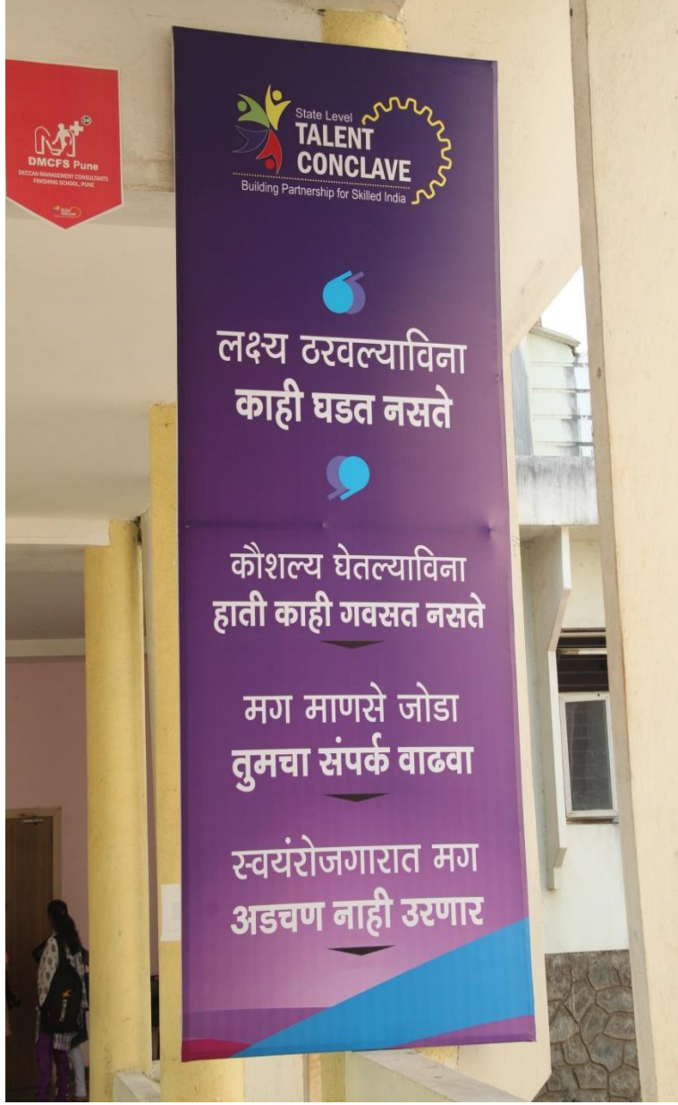
Standees displayed at the venue