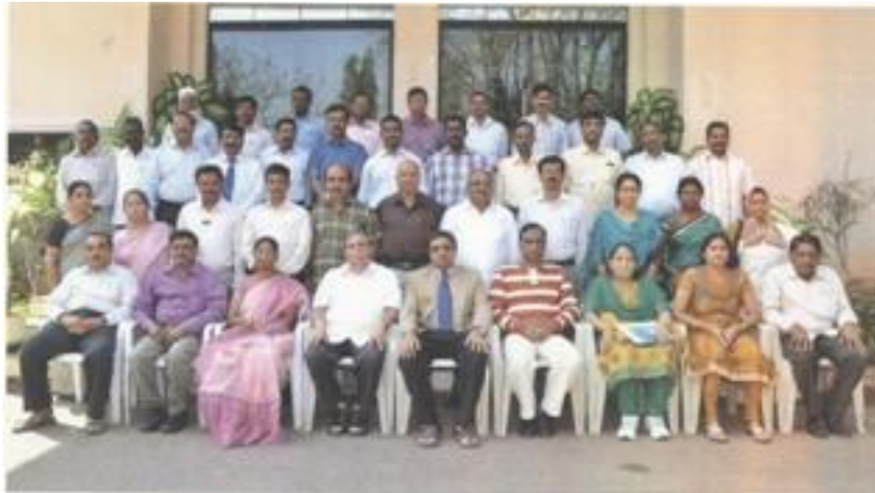
Review Meeting at NIMSME Hyderabad

Accordingly, three Partner Institutes of NIMSME Hyderabad namely Time Industrial & Entrepreneurship Development Institute Kolhapur, MITCON Consultancy & Engineering Services Pune and Suraj Foundation Sangli were given the responsibility of conducting the Talent Conclave.