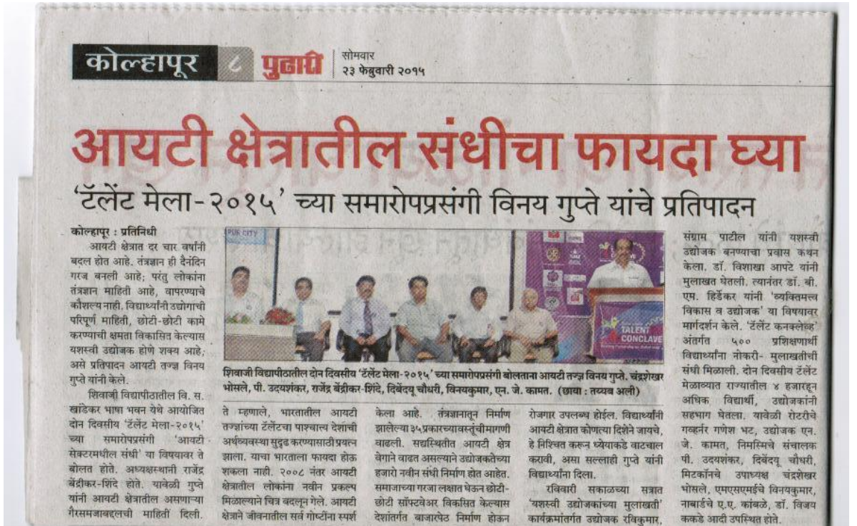
The news published about the State Level Conclave in leading newspaper Pudhari