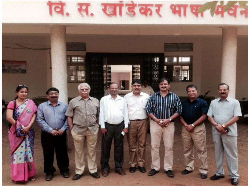
Organising Committing Meeting on 23-01-2015