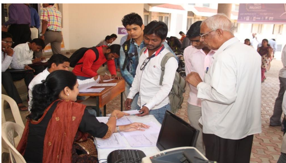
Spot Registration is in progress