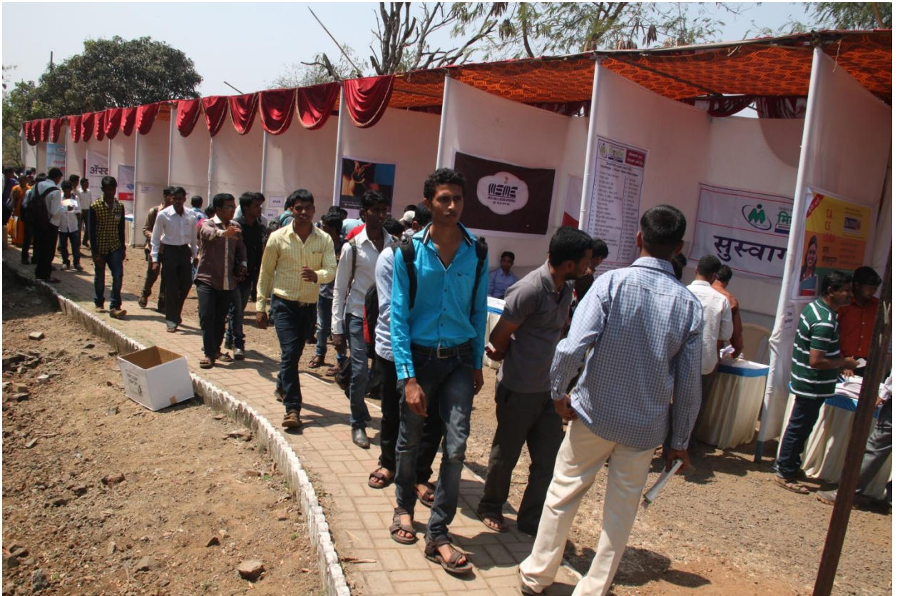
Stalls in the State Level Talent Conclave