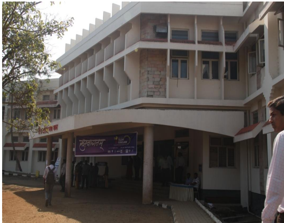
Venue of the State Level Talent Conclave

The venue V.S. Khandekar Bhasha Bhavan, Shivaji University, Kolhapur was selected for the State Level Talent Conclave.