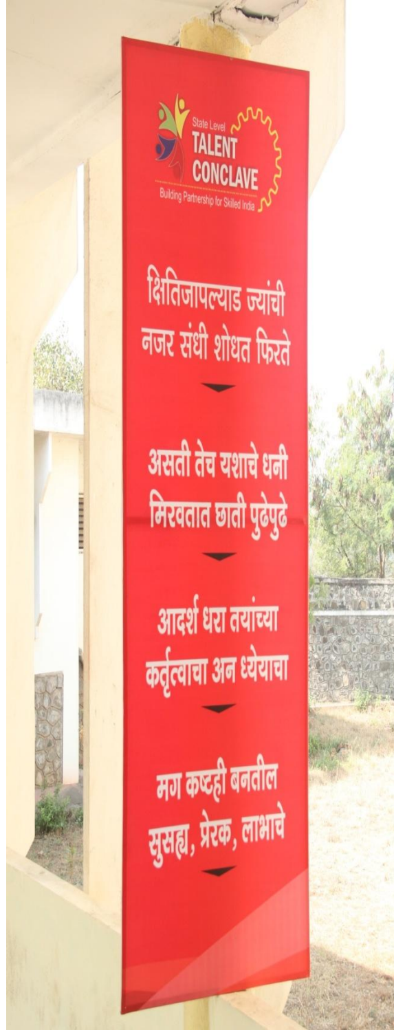
Standeers displayed at the venue