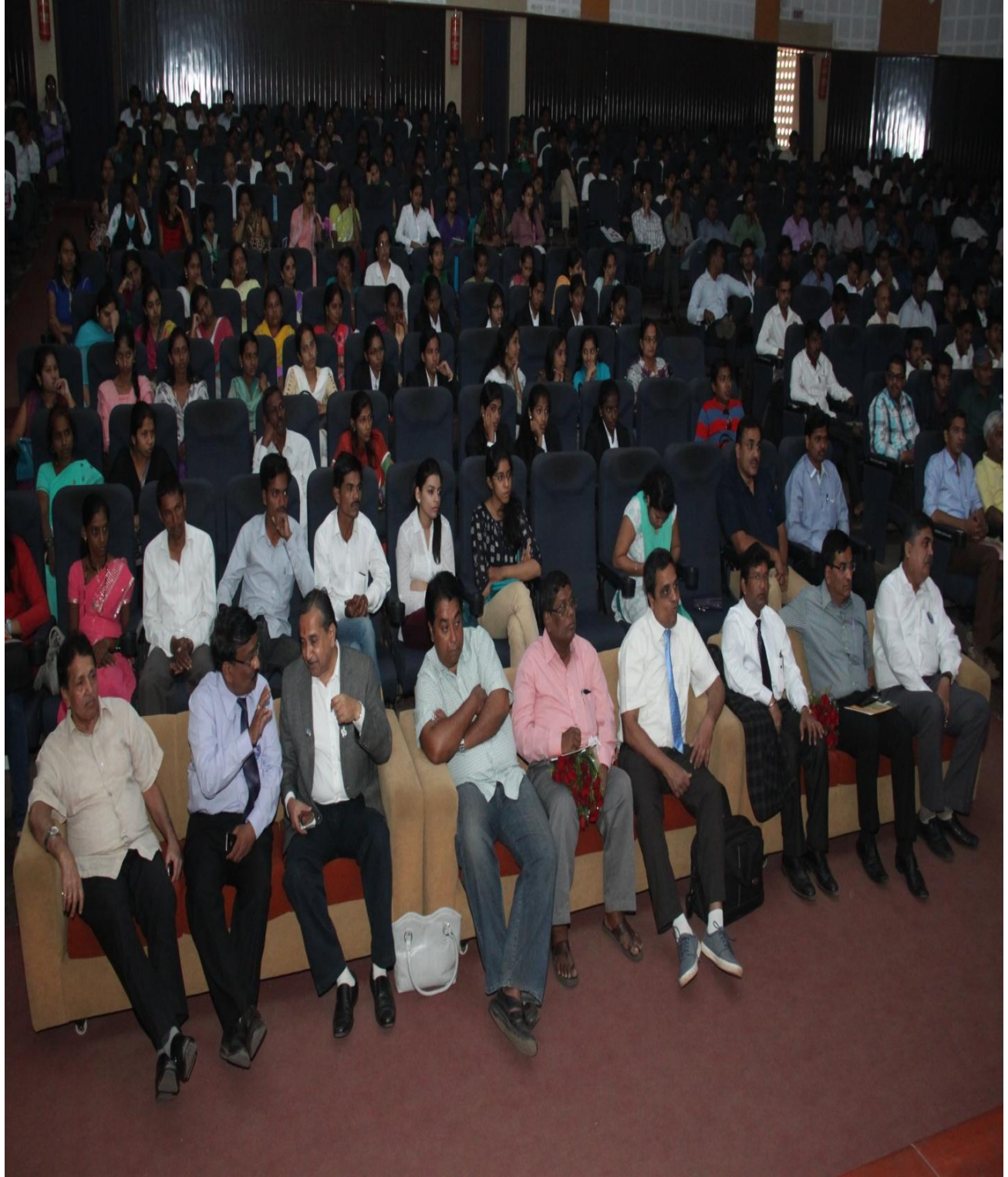
Audience for the State Level Talent Conclave