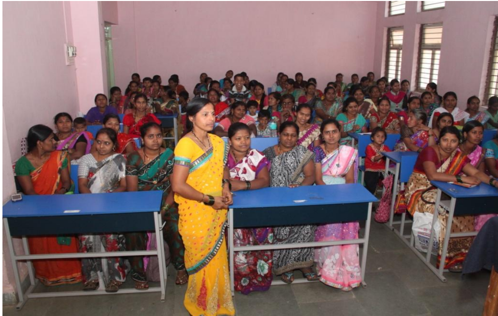
Campus Interview for Garment Sector is in progress

Felicitation of the key note speakers was done with floral bouquets and mementos.