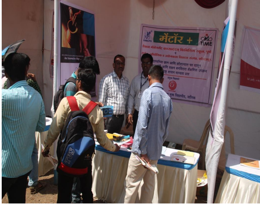
DMCFS Pune Stall