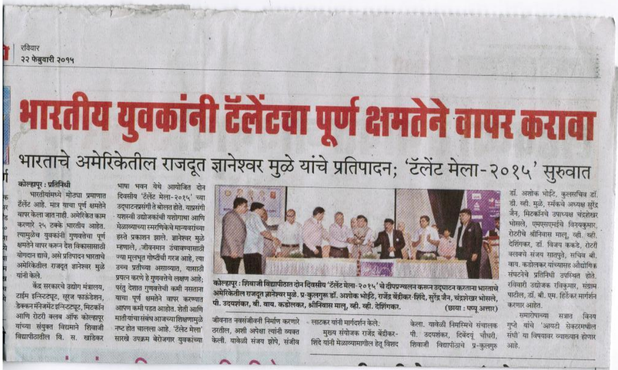
The news published about the State Level Conclave in leading newspaper Pudhari