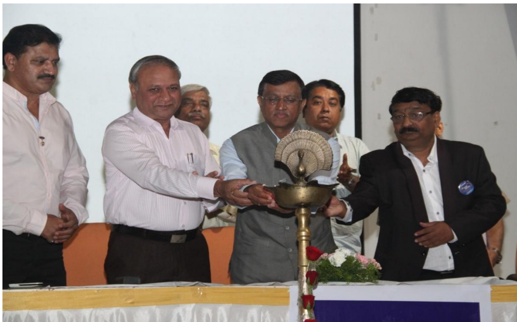
Lighting of Lamp by the Chief Guests