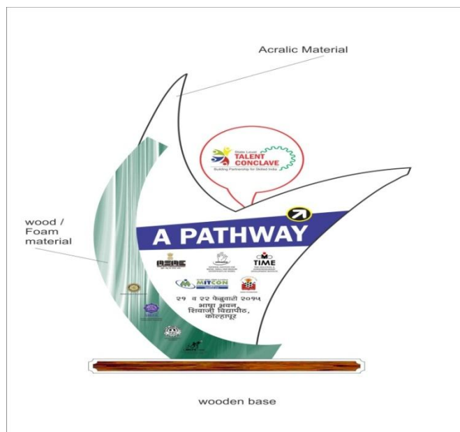
Design of the memento presented to the guests

Lighting of Lamp The ritual of Lighting of the lamp was performed by the Chief Guest and other guests,