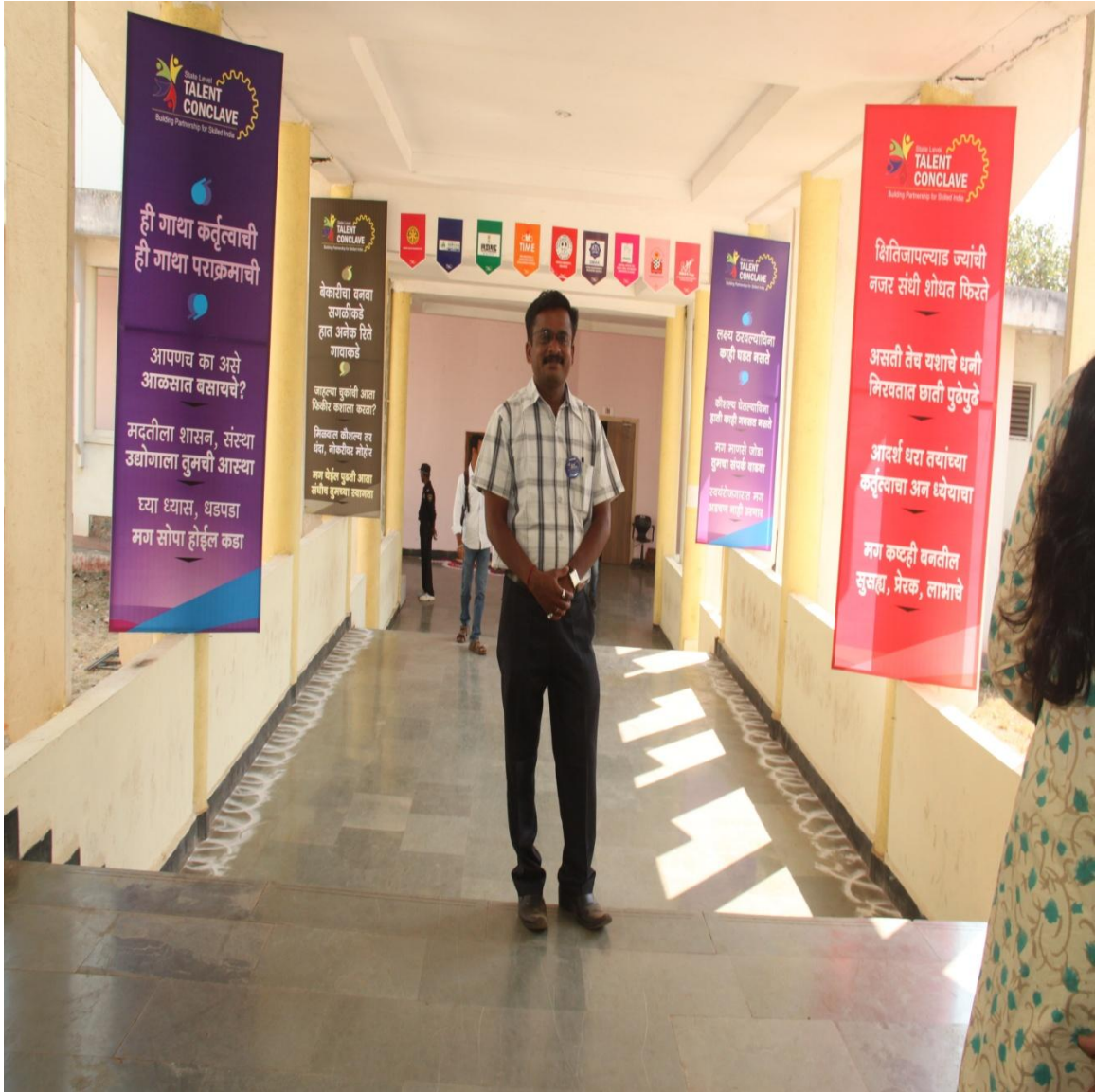
Entrance of the venue