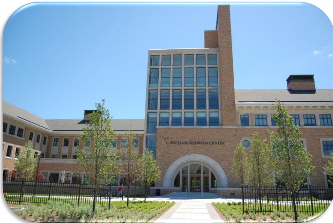
L. William Seidman Center opened May 2013.

If you did not find what you need in this document, or if you simply need some advice or assistance, contact the Graduate Business Office at 616-331-7400.