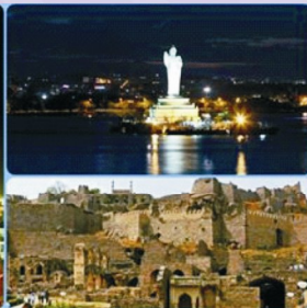
Golconda Fort & Buddha Statue