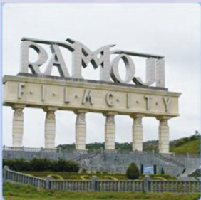
Ramoji Film City