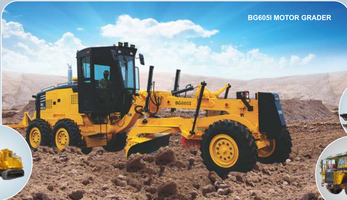
BG605I MOTOR GRADER