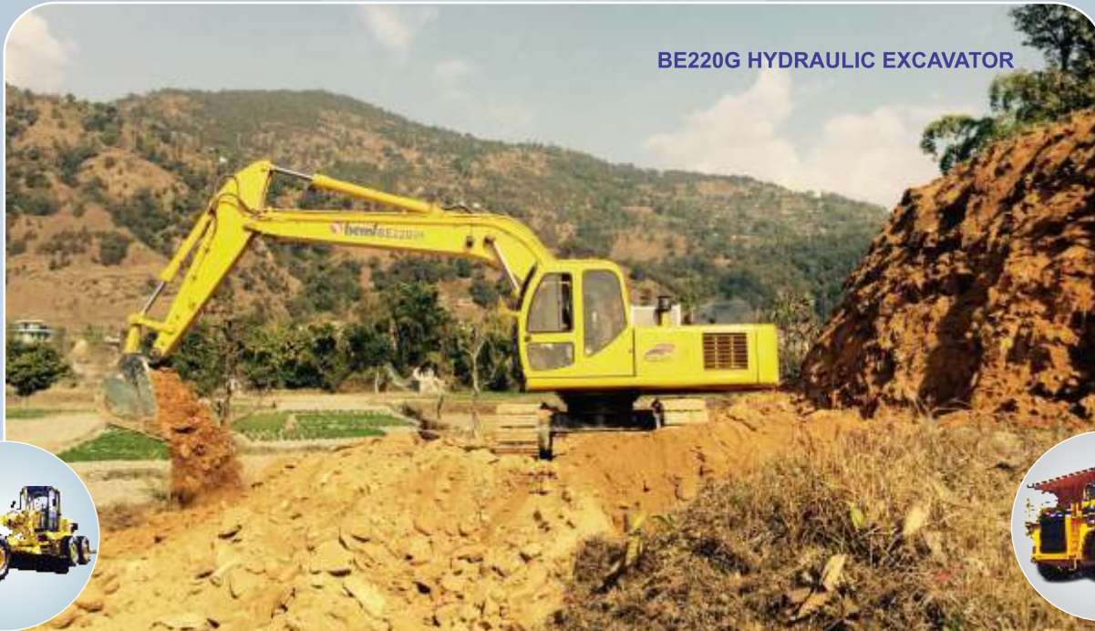
BE220G HYDRAULIC EXCAVATOR