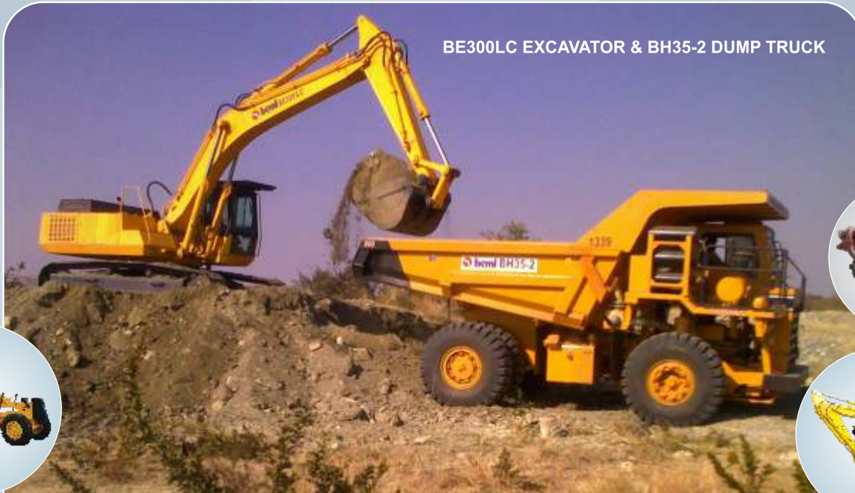
BE300LC EXCAVATOR & BH35-2 DUMP TRUCK