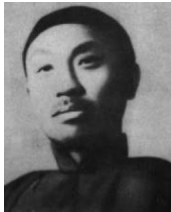
Fig. 3.3 Chen Duxiu

Almost all the advocates of the New Culture Movement were associated with Beijing University. These revolutionary intellectuals had been publishing articles in a number of newspapers and journals within and outside China espousing and experimenting with new ideas to salvage China since the beginning of the twentieth century. However, the beginning of the movement was the launching of a journal called The Youth (later named The New Youth ) in Shanghai in 1915. Chen Duxiu, an experienced revolutionary and former Tongmeng Hui member was the founder editor of the journal. It started as an intellectual response to President Yuan Shikai's acceptance of Japan's Twenty-one Demands.