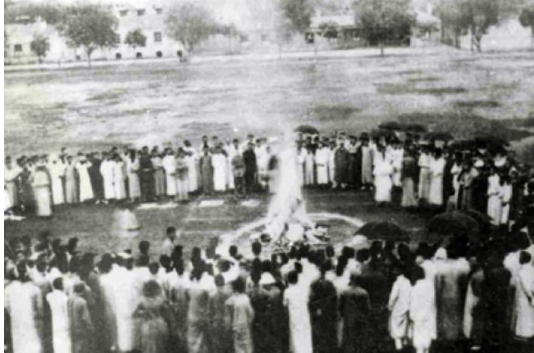
Fig. 3.4 Students burning Japanese books during the May Fourth Movement