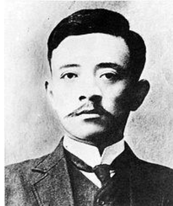
Fig. 3.1 Song Jiaoren

It was clear that parliamentary methods would not be effective to restrict Yuan's dictatorship. In May 1913, Sun Yat-sen and others prepared an armed uprising to remove Yuan from power. They approached the provincial military-gentry governors for support. This short-lived trumpery affair of 1913 is commonly called the Second Revolution (Dierci Geming). Yuan quickly bought the loyalty of the provincial military leaders and revamped his Beiyang Army with the money he borrowed from the foreign banks. Yuan crushed Sun's Second Revolution within months, charged the Guomindang with sedition and banned it. Sun Yat-sen fled China in August. In 1914, Yuan dissolved the National Assembly and appointed a political council to draft a new constitution. This body was composed of Yuan's cronies. The new constitution granted unlimited power to the president, including extending the terms of office to ten years which was renewable by re-election thereafter, and also power to select a successor. Yuan then tried to reign in the provinces under central rule, but achieved only limited success. Thereafter, Yuan plotted to gain absolute power by reviving the monarchy. He encouraged his men to petition him i.e. the President of the Republic, for the revival of monarchy. He then pretended to bow to the public pressure and made himself the emperor in late 1915. Yuan had calculated that in the midst of the First World War, foreign powers would not meddle too much in the internal affairs of China.