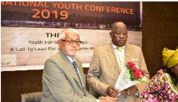
Hon'ble President presenting bouquet to Ambassador of south sudan to india