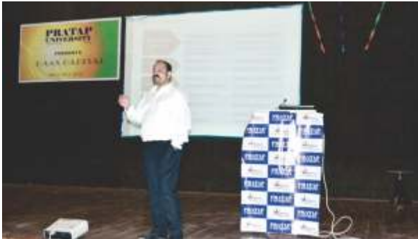
Sr. HR Manager, Raas Capital addressing students