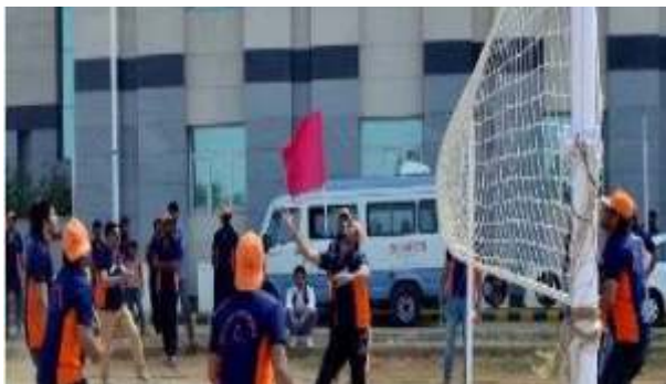
Students playing volleyball match