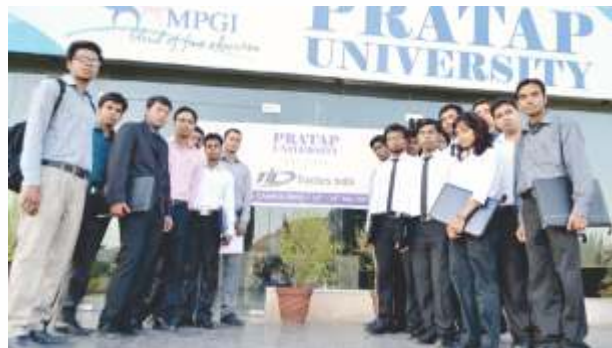
Selected Students of Tractors India Ltd.