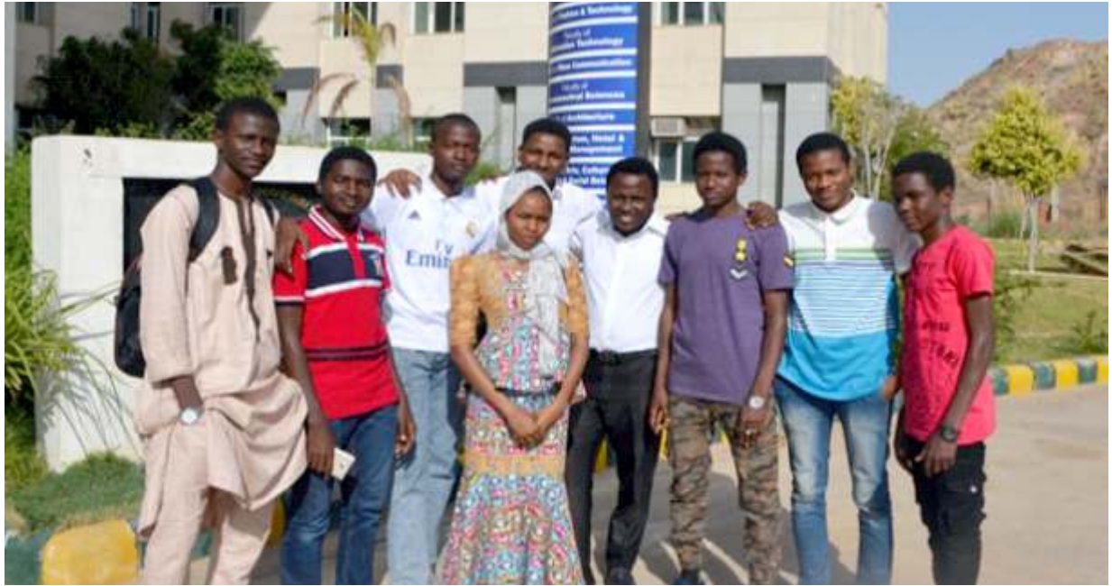
International students enjoying in the campus