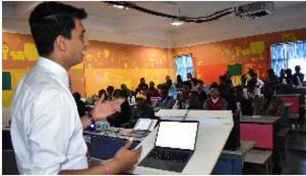
Technocrat addressing students