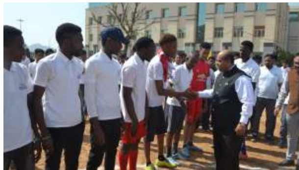
Hon'ble Chairperson interacting with international students in the play ground