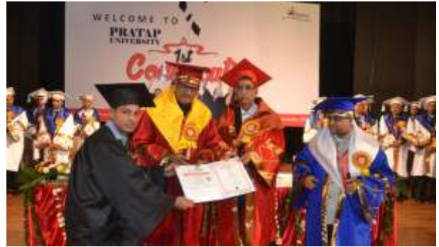
Topper Students given medals by Chief Guest & Guest of Honour