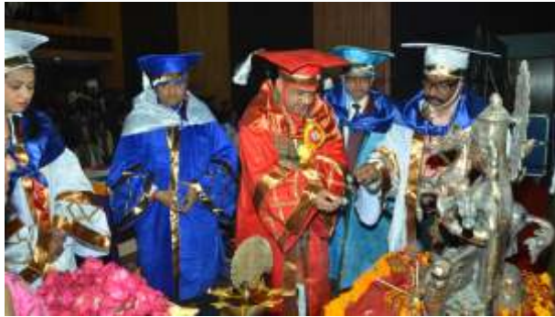
Lightening of the Lamp by dignitaries at 3rd Convocation