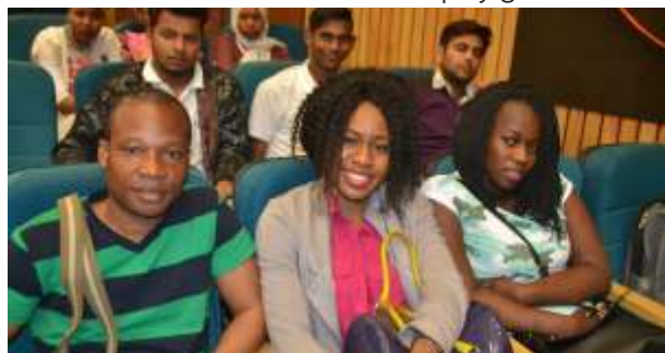
International students enjoying the cultural program