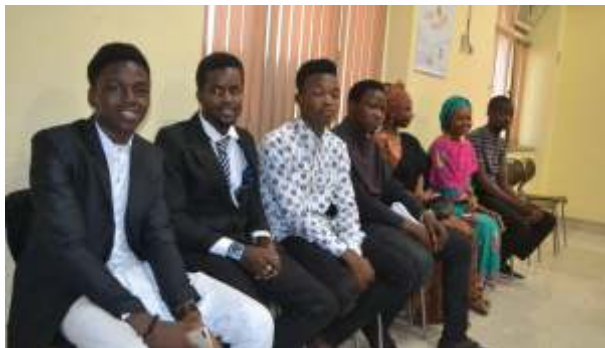
International students relaxing after completion of sport's