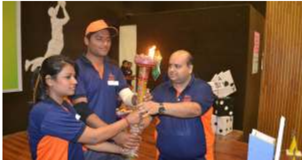
Hon'ble Chairperson inaugurating the University program