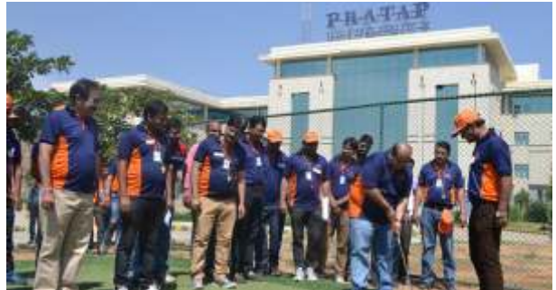
Hon'ble Chairperson with international students in the golf court