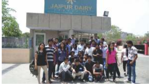
Industrial Visit to Jaipur Dairy