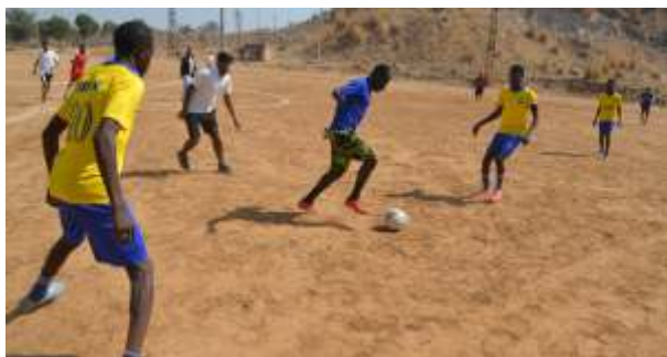
. International students playing football