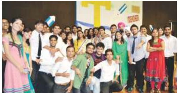
Students enjoying program held in the eve of teachers day