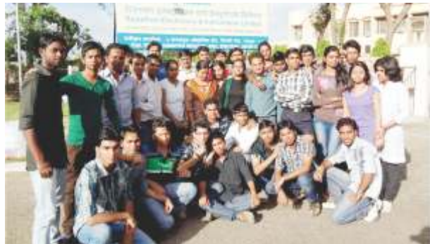
Industrial Visit to Rajasthan Electronics & Instruments Limited