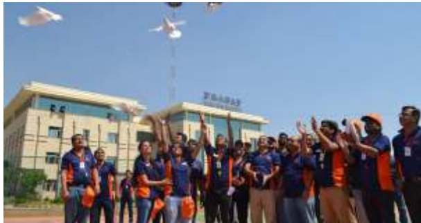
Students enjoying in the University campus