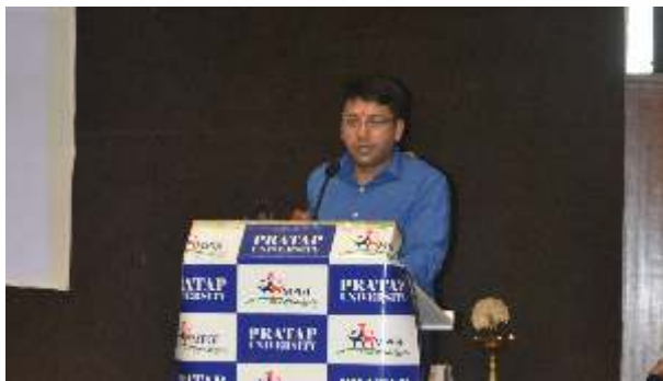
Sr. HR, ZTE interacting with students of Pratap University