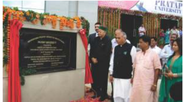
Inauguration Ceremony of Pratap University by Hon'ble Sri Virbhadra Singh (Union Minister of Small & Medium Enterprises, Govt. of India)