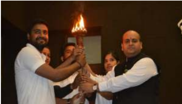
Hon'ble Chairperson inaugurating sports event