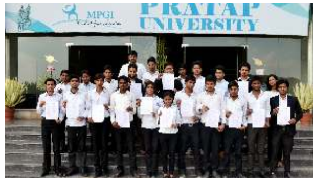
Placed students with their offer letters