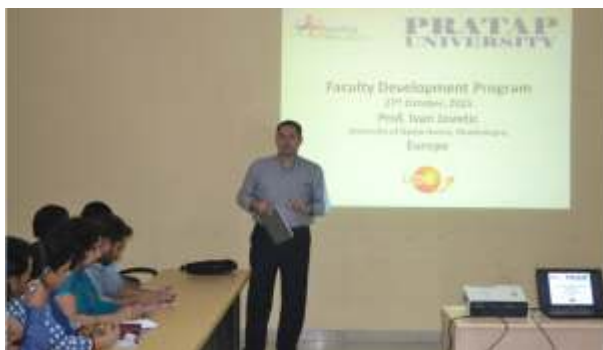
Faculty Development Program