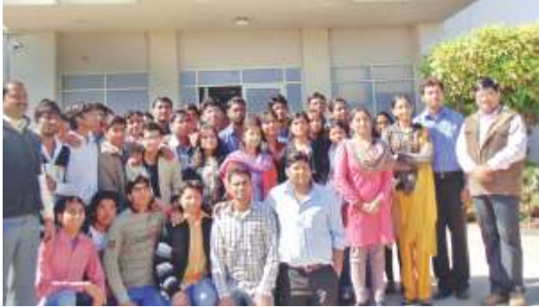
Student on an industrial visit to Dainik Bhasker press