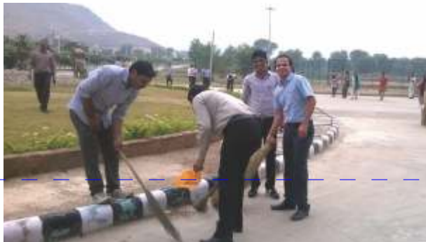
Faculty & Staff participating clean india mission