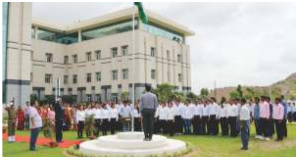
Hon'ble President hosting flag on independence day