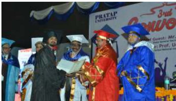
Chief Guest Mr. Sunil Bansal, State General Secretary BJP felicitating the meritorious students