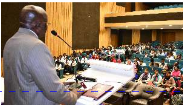
Ambassador of South Sudan to india Addressing students of the University