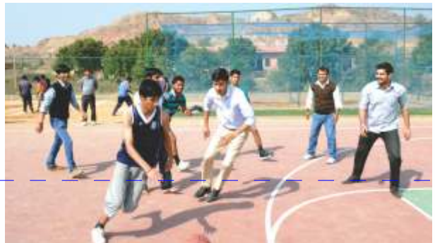
Students playing game