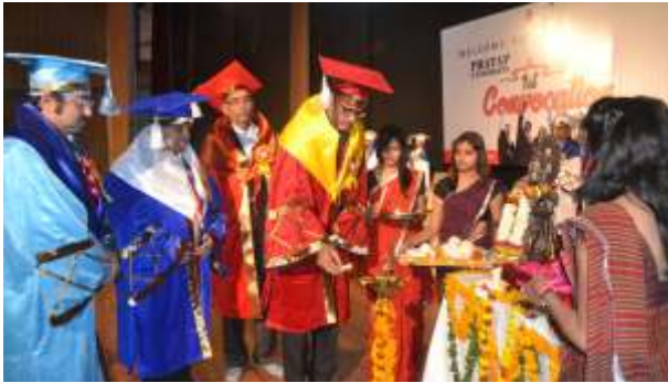
Lightening of the Lamp by dignitaries at 1st Convocation