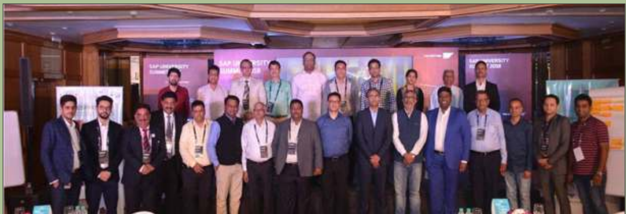
Hon'ble President of PU attended SAP University Summit 2018, Goa