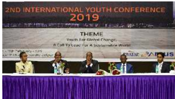
International dignitaries on the stage in the 2nd youth conference