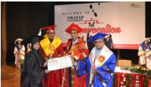
Dignitaries giving medals & awards to the toppers