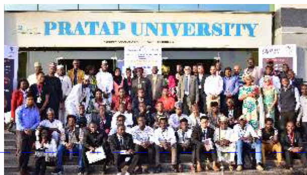
International students with faculty members & officials of the University