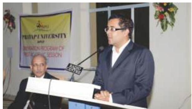
Chetan Bhagat addressing the university students in its Orientation Programme at Pratap University campus