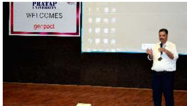
HR Genpact during placement drive