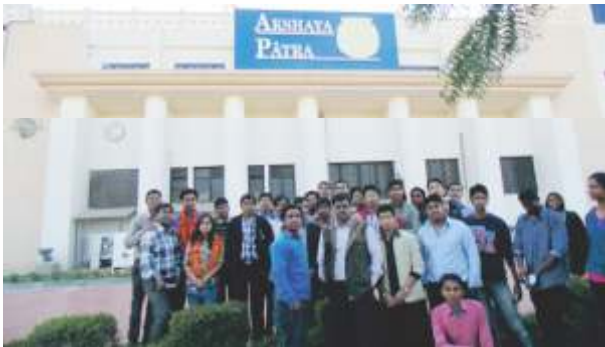
Industrial Visit to Akshaya Patra