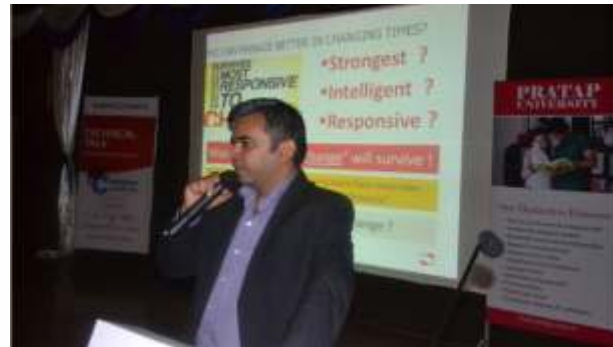
Technical Workshop @ Pratap University