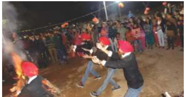
Students celebrating lohri festival