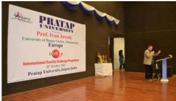
Career Counselling Seminar by International Faculty