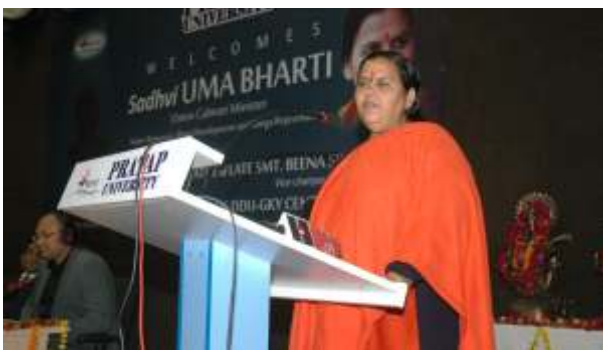
Sadhvi Uma Bharti, Union Cabinet Minister addressing the students in Pratap University Auditorium