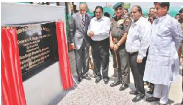
Former Chief of Army Staff Gen V. K. Singh inaugurating the Boys Hostel at Pratap University campus.