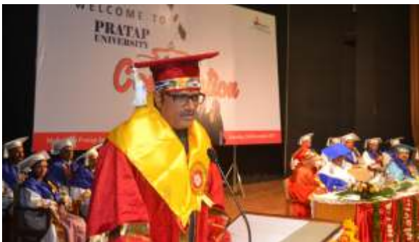
Shri Rajendra Rathor, Minister in Rajasthan State Government as Chief Guest at 1st Convocation