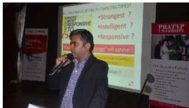
Technical Talk by Sopra Steria