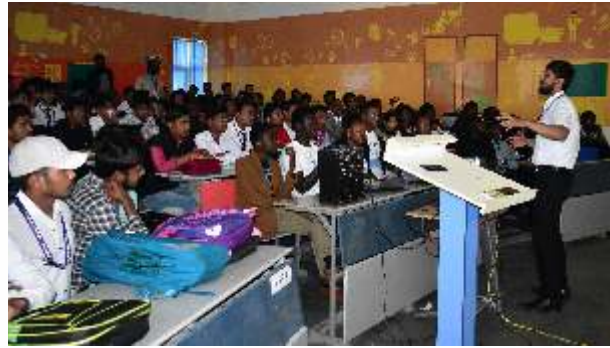
Technocrat interacting with students