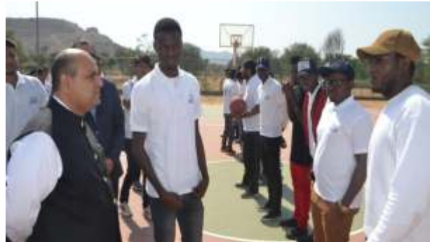
Hon'ble Chairperson courtesy meet with students before match