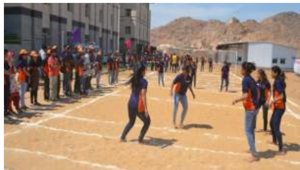
Girls during Kabaddi Match