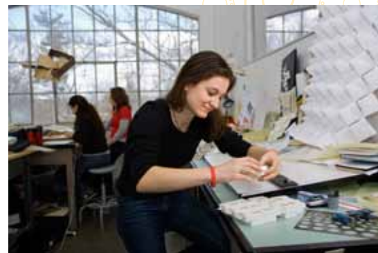
An international student in one of the studios in the College of Architecture, Art, and Planning