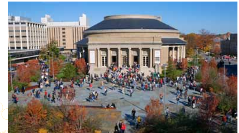
Students on Bailey Plaza, Cornell University

www.admissions.cornell.edu/apply/international/faid.cfm