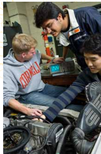
Members of the student AXP Automotive X-Prize team in the lab