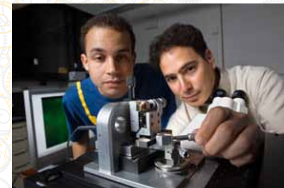
A tissue deformation device being closely examined by its creators in Clark Hall