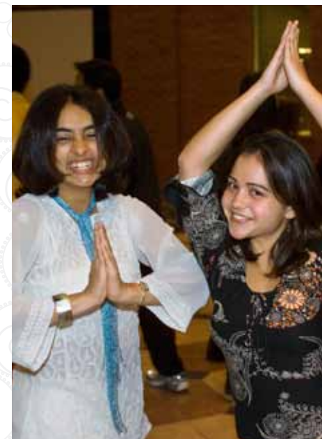
Students at a joint international dance performance and instruction session in Sage Hall's atrium