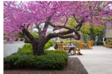
Students study outside Carpenter Hall on the Engineering Quad, Cornell University

For more than a century, Cornell has benefited from its many connections to India. The Tata Scholarship for Students from India will ensure that these connections continue to grow even stronger.