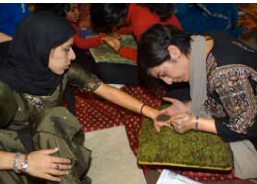
Henna painting at the Herbert F. Johnson Museum's Arts of India public program