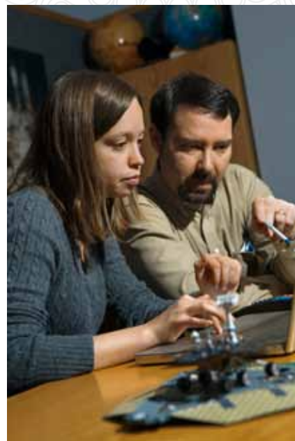
A student and professor work on the Mars Rover Project in the Space Sciences Building