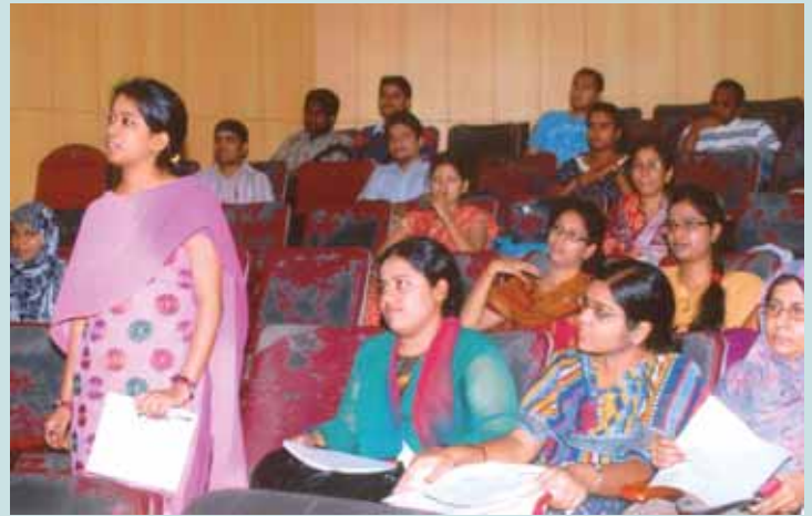
Students during the contact programme of PG Diploma in Business Management