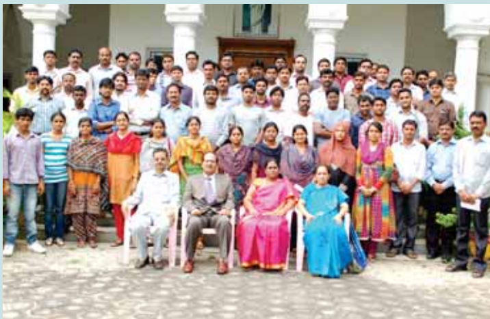
Participants of PG Diploma in Project Management