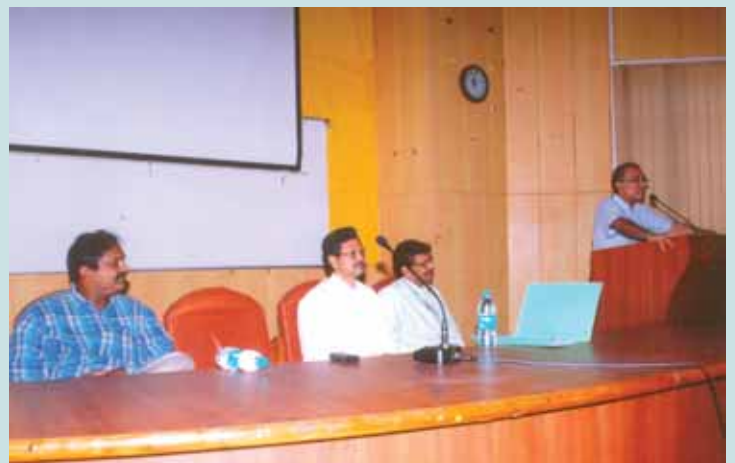
Vice Chancellor, UoH inaugurating the PG Diploma Business Management Programme