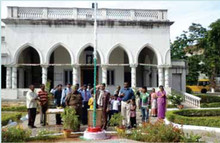
Independence day celebrations at Golden Threshold Campus, UoH