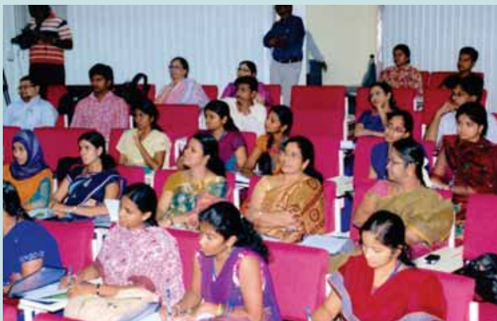
Participants in the one day Seminar on "Criminal Justice System in India : Basic Functionaries & Procedures"