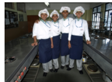
PTU Hotel Management Students during a session in the Kitchen of Learning Centre at Lucknow

Fill the form correctly and attach all relevant documents asked in the form.