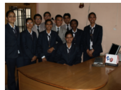
PTU Hotel Management Students during a session on the Front Desk of Learning Centre at Lucknow