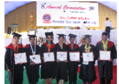
Students from U.P., Uttarakhand, M.P., Chattisgarh before the convocation stage after the convocation gets over.