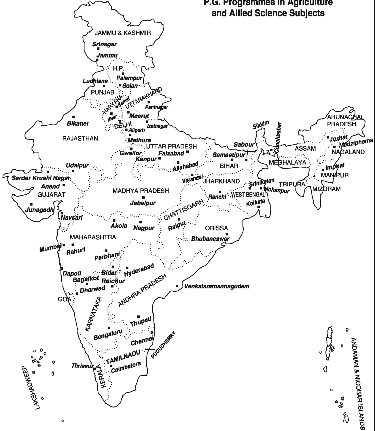
(Map is only indicative and not to scale)

Location of Universities for admission in P.G. Programmes in Agriculture and Allied Science Subjects