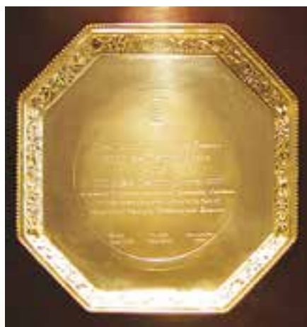
PAU won the Best Institution Award of ICAR in 1995

The College of Agricultural Engineering & Technology and the College of Agriculture received the Federation of Indian Chambers of Commerce and Industry Awards in 1975 and 1977, respectively. The PAU received the Best Institution Award of ICAR in 1995, in the very first year of institution of this prestigious award. A first ever special grant of Rs. 100 crore was awarded to the University by the Government of India for undertaking basic and strategic research in agriculture in the year 2006. The University earned the distinction of being the first State Agricultural University to be conferred with the first International Potash Institute (Switzerland) and Fertilizer Association of India (IPI-FAI) Award for transfer of technology in the balanced use of fertilizer in 2010. PAU was again the first University to bag Agricultural University of the Year 2011 Award (Krishi Shiksha Sanman) in the first year of its institution by the Mahindra & Mahindra.